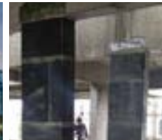
Repair & Retrofitting