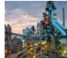
Grouts & Anchors